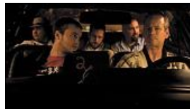
Much of the filming of "Left Alone" was done in a cab at night.